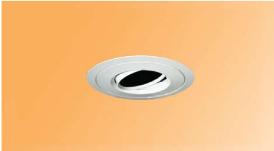
Lana MR11 Adjustable